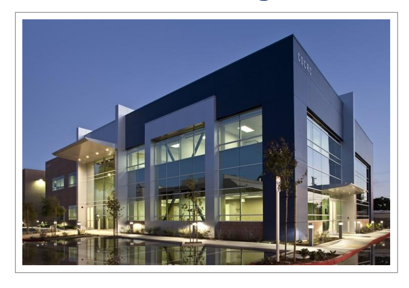
Thursday – Saturday June 6 - 8, 2024

The Lundquist Institute for Biomedical Innovation at Harbor-UCLA, Torrance, CA